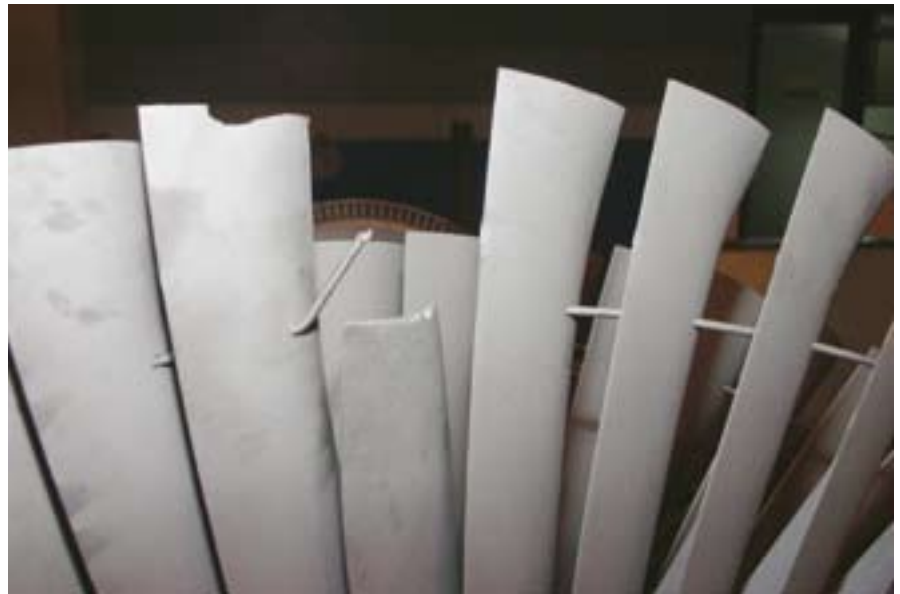
Incoming condition of the last stage blades.

the natural frequencies from resonant as well as increasing the blade safety factor to counter indicated problem and eliminate all risks.