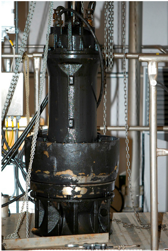
One of the AFLX pumps lifted up from the sump before being sent for regular condition monitoring