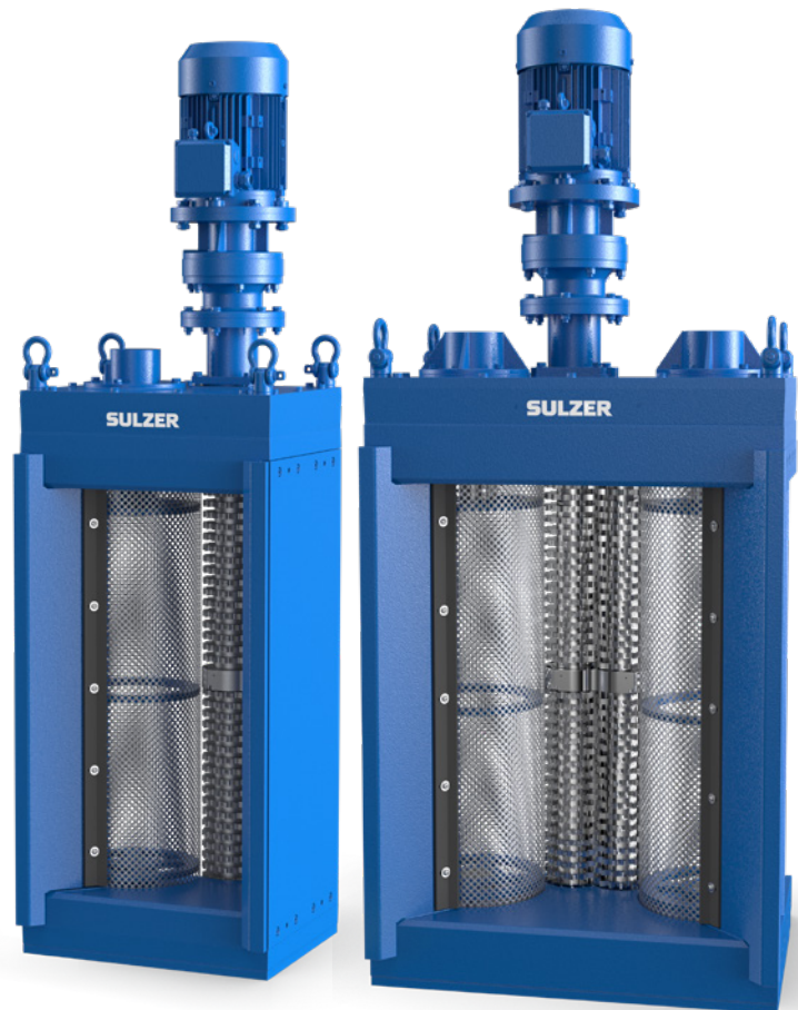
CMD single drum model

Channel Monster grinders are available in a single or dual drum model.